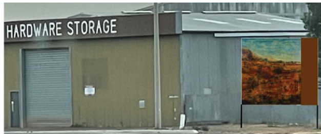
Billboard Competition Winner Heather Lyall - Titled "Australia Our Country"

Council has endorsed the proposed site for the billboard installation as presented by Council's Economic Development Unit on the eastern side of the Kidman Way as seen below. It will be on the road reserve approximately 10 metres south of 30 McGee Street Hillston pending approval from all relevant authorities