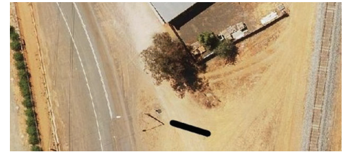
Arial View of proposed billboard