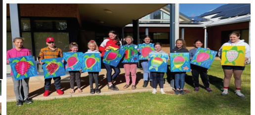
Hillston Event 30 June 2021

Council held a School Holidays Free Event in Hillston and Goolgowi on 30 June and 1 July respectively. Over the two day event children who attended enjoyed a day of fun and creativity.