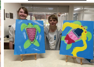
Goolgowi Event 1 July 2021