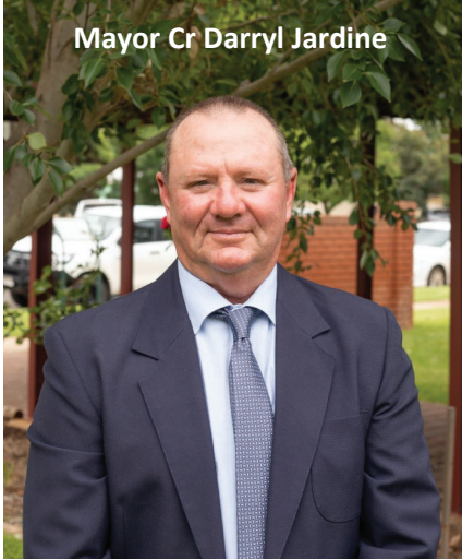
Mayor Cr Darryl Jardine