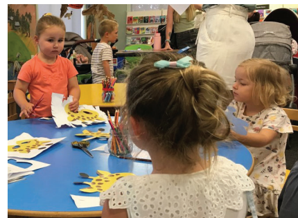
Photos from Story Hour